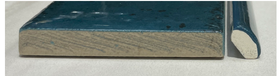
1/2 x 12-3/4 SBN (Pencil Bullnose/Jolly) with field tile.