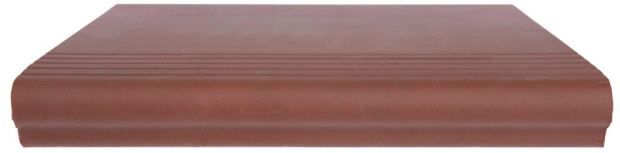
12 x 12 Step Nose

The Step Nose is slightly thicker than field tile. The Step Nose is produced in a different production and will be a different shade than the field.