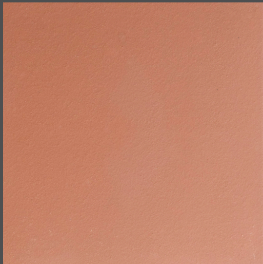
Light Red (CTRL)