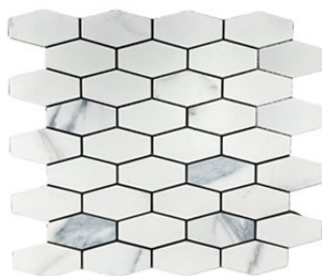
3" Elongated Hex Mosaic

This line is a collection of different marbles, and each of the 6 colors has its own product sheet. Please see other pages for information about the other colors.