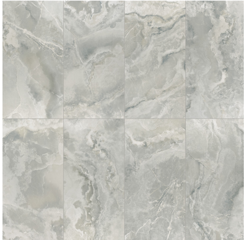
Florence Grey - With Onyx style graphics, it is a medium grey.