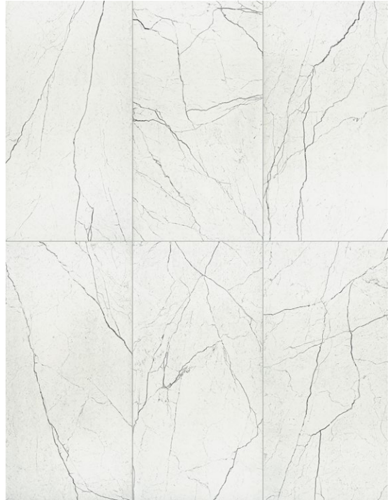
Cortina White - Inspired by the Biancone marble but with well-defined, directional veining, it is white with grey veins.