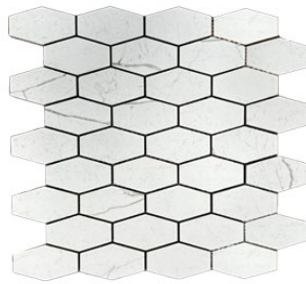
3" Elongated Hex Mosaic

The Brick Mosaic sheets can be used as field or cut and combined with field tile to create cost effective strips or decorative inserts.