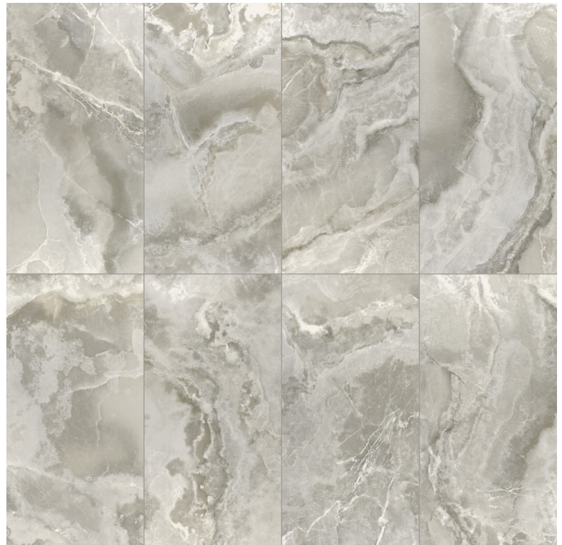
Antique Portofino - With Onyx style graphics, it is a warm grey/taupe.