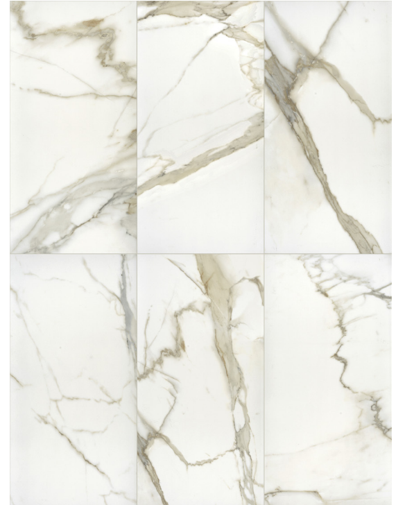
Amalfi Lux - Inspired by the Calacatta Oro Borghini marble, it is white with gold veining.