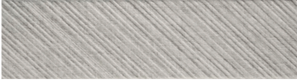
3 x 12 (MCTE--/312) Non-Rectified