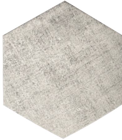
8 ½” Hex (MCTE--/9HX) Non-Rectified