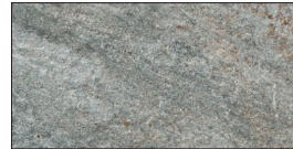
12 x 24