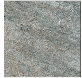
24 x 24