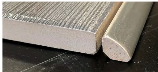
Pencil Bullnose with field tile