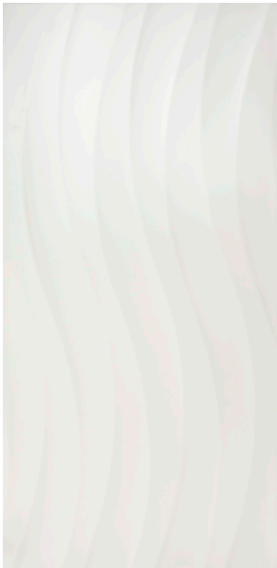
White Matte (LADUWM)

The softly undulated surface of Lanka's Dune series mimics the rolling hills of sand on the beach. Structured wall tile at a competitive price, this series can be used in entire areas or as an accent with coordinating products.