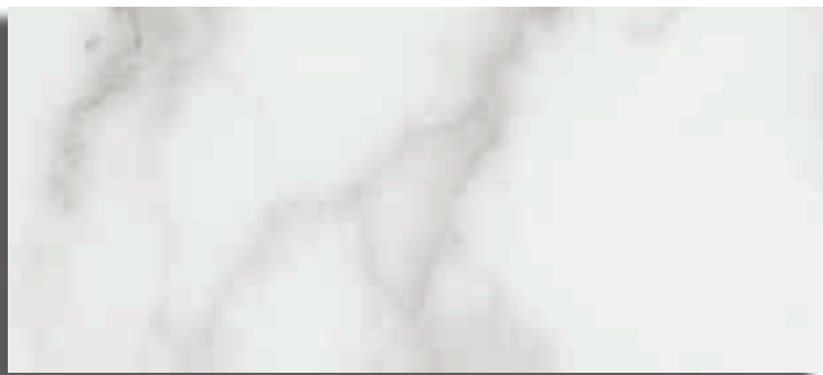
24 x 48 - Available in Natural and Polished