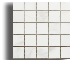
2 x 2