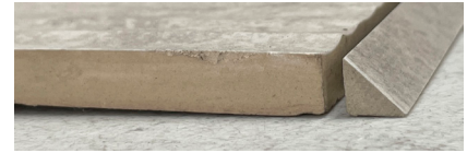
Trim with Field Tile

For the white colors - Sugar (ACAYSR) and White Glossy (ACAYWG) - Tuxedo (LATO) is a good option for coordinating trims.