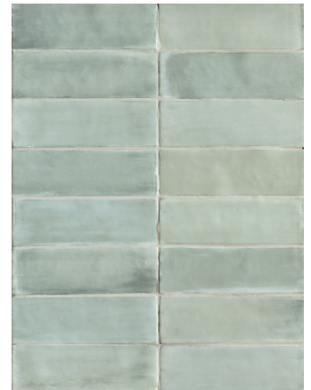
Sea Glass (SATTSG)