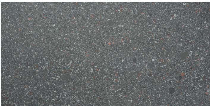
Dark Grey (LOOEDG)