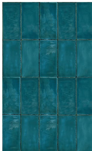
Blu di Prussia (SAMEBP)