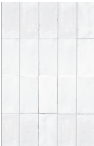
Bianco Antico (SAMEBA)

Memorie takes us back to the artisan ceramic tradition with the historic 2.5x5 brick size and a color palette that was painstakingly studied. The colors have nuanced shade variation that is enriched by the glossy crystalline glaze. The final look creates a mood where modern design confronts a taste for the vintage aesthetic which never goes out of style. The bisque is made by multiple molds that have some irregular edges and surface imperfections, and there is intentional shading and glazed details that give the material a handmade look and feel.