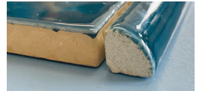
1/2 x 10 SBN (Pencil Bullnose/Jolly) with field tile.

SAME--/110SBN 1/2 x 10 SBN (Pencil Bullnose/Jolly)