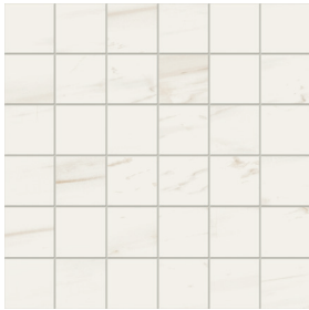
2 x 2 CGLABON/22

The surface bullnose is made from field tile that is cut, ground and reglazed.