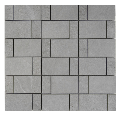
Quilt Mosaic (VWAE-/QM)

It can also be cut into strips to make a striking decorative accent.